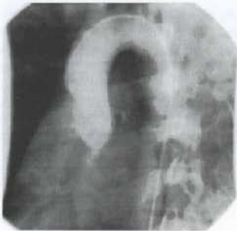
Fig 1 B. Aortographic image.