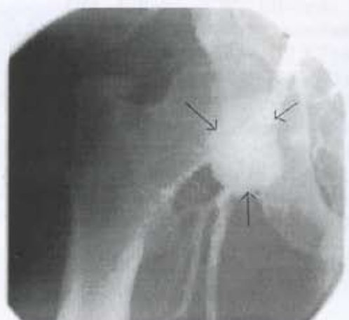
Fig 2. Right femoral artery aneurysm.