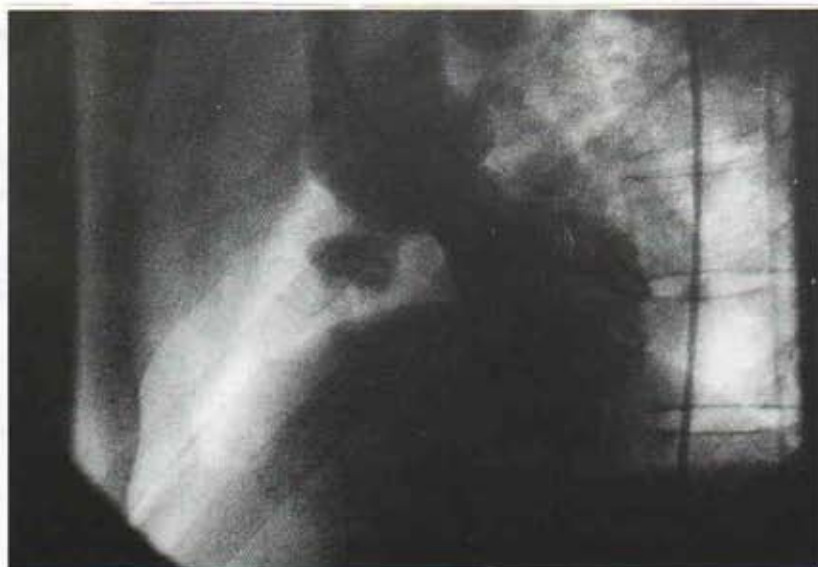
Fig. 1. Preoperative left ventriculography of the patient showing a ventricular septal defect with an aneurysmal formation of the septum.

Anomalous bundles and fibrotic tissues were resected, preserving the moderator band. The right ventricular cavity was enlarged, allowing a 20 mm dilatator to pass. The pulmonary