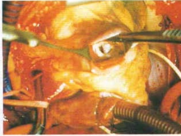
Figure 2. Operative view showing a muscular diaphragm in the right ventricle with an orifice of 10 mm lined with white fibrous tissue.

cusps and pulmonary artery were of normal width and structure. Ventricular septal defect was closed via right atriotomy using a Gore-Tex patch (Fig. 2).