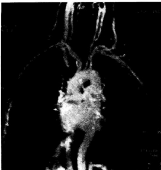
Figure IV: Patient recovered both clinically and anatomically after the operation.

maintained with isoflurane, fentanyl, air/oxygen mixture. Hemodynamic stability was preserved and overhydration was avoided during operation. Surgical repair consisted of thrombectomy and patch repair of superior vena cava with autologous pericardium (figure 3). Also, PTFE tube graft was placed between left brachial artery and cephalic vein to create a-v by-pass. Patient recovered both clinical and anatomical after the operation (figure 4).