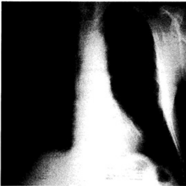
Figure I: The chest x-ray revealed no mediastinal widening, subclavian catheter was seen in right subclavian vein

A 44 year old man with endstage renal failure secondary to hypertension were treated with hemodialysis over ten years. Unfortunately, because of problems regarding arteriovenous fistulae, multiple central venous cannulations were required for dialysis. Last time right subclavian vein cannulation was performed permanently and used several times during 3 months for hemodialysis. In early July 2004 he presented with sudden onset of facial swelling and distended veins over his chest wall. Complaints of the patient were increasing as he lied down and with hydration. The chest x-ray revealed no mediastinal widening, subclavian catheter was seen in right subclavian vein (figure 1). Magnetic resonance imaging and angiogram revealed the obstruction of vena cava superior at the level of innominate vein (figure 2). In a two days period; history of dyspnea, headache and hypertension were also included into the case. The patient had anticoagulation therapy , dialysis support , antihypertensive medication before the operation.