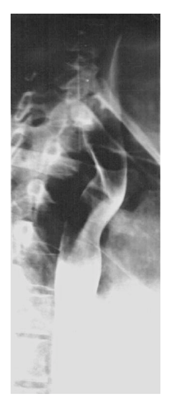
Figure-2: A lateral radiograph of the chest after a barium swallow showing anterior displacement of the esophagus due to a retroesophageal right subclavian artery.

Case 2: A 41 year old female patient, who presented in our clinic with quick tiredness and feeling cold on the right upper extremity. In physical examination, the right brachial, radial, and ulnar artery pulses were nonpalpable. Left brachial artery pressure was measured 170 mm Hg, whereas the right brachial artery pressure 60 mm Hg. Using angiography, the right subclavian artery was observed to originate from thedistal part of the aortic arch and was located dorsomedial to the left side of the left subclavian artery. The right subclavian artery was occluded at the origin of the vertebral artery. A collateral axillary artery, which developed proximal to the occluded segment and anastomosed with muscular branches, appeared weak and had a small diameter. Right brachial artery filling was observed with angiography. External pressure was suspected in a barium swallow radiograph at the level of the aortic arch along the posterior aspect of the esophagus (Figure 2).