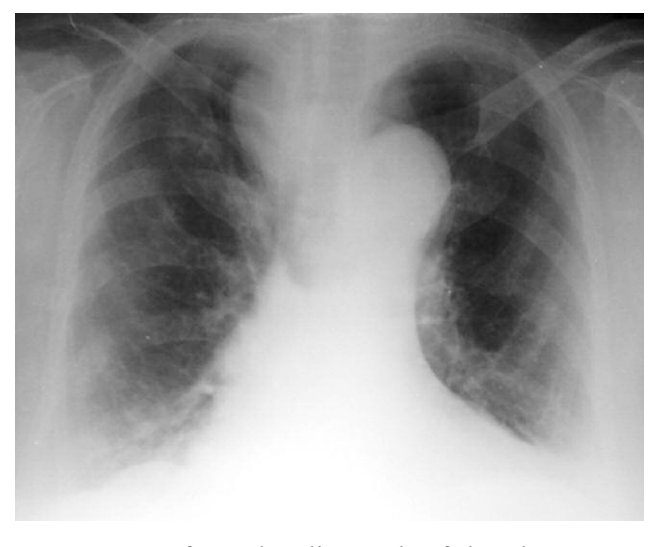
Figure-1: A frontal radiograph of the chest showing an upper mediastinal mass due to an aneurysm of the aberrant right subclavian artery and Kommerell's diverticulum.

and fusiform aneurysmatic dilatation nearly 2 cm in size in its proximal segment. Right vertebral artery originated from the right subclavian artery in a normal anatomical localization, but it was hypoplasic. The patient recovered from pneumonia, but did not accept surgical intervention.