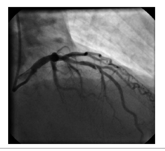
Figure 1: The coronary angiography demonstrated a localized 2 cm thin radiolucent line consistent with dissection at the level of second diagonal branch of left anterior desending artery (LAD) and a lesion just proximal to dissection.