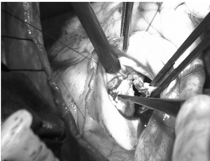
Figure 2: Removal of the calcific pulmonary valve

This calcification was localized to the valvular area and also it was found to be invading the subvalvular area. During surgery, we only resected the valve and reconstructed the right ventricular outflow tract with a glutaraldehyde treated pericardial patch (Figure 2).