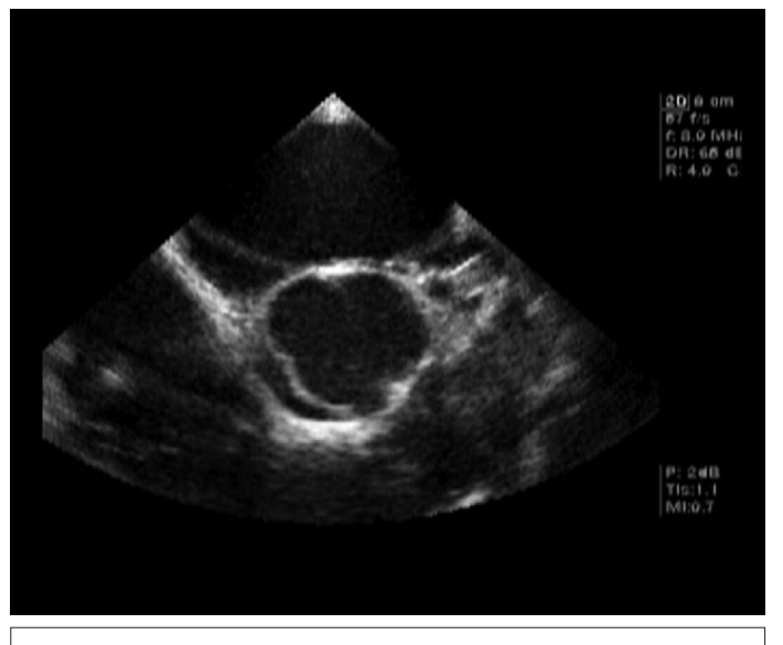
Figure 1: The short-axis TEE view showed typical bicuspid aortic valve