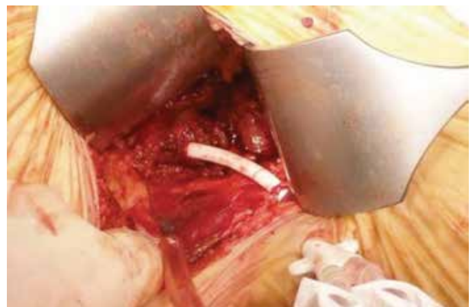
Figure 3. Vena cava inferior catheterization by right lateral abdominal incision. (Case 2), VCI: Vena cava inferior

A 66 years old male patient who was scheduled to have hemodialysis 3 times a week for 9 years was referred to our clinic for ineffective hemodialysis. The patient had a history of multiple upper extremity arteriovenous shunt operations and placement of a synthetic graft between right femoral vein and artery for the purpose of the hemodialysis, all of which had failed recently. Before an attempt to place central venous catheter, an ultrasonographic examination was carried out to evaluate the patency of the subclavian, jugular and femoral veins, all of which was revealed to be occluded. The magnetic resonance venography confirmed the diagnosis. Peritoneal dialysis was not an option for this patient for he had several