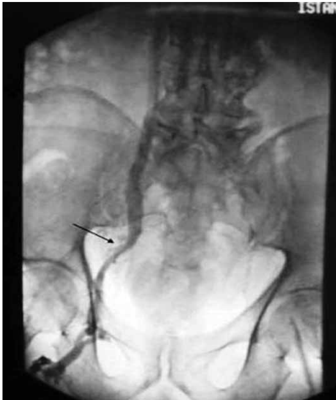
Figure 1. Magnetic resonance venography (Case 1), black arrow: iliac vein

haemodialysis. Upper and lower extremity venography was done before the decision on the site of a new vascular access. Venography, however, revealed occluded bilateral subclavian and jugular veins as well as an occluded left iliac vein. Right iliac vein and IVC was visualised to be open (Figure 1). Patient then was taken to the operation theatre for the catheterization