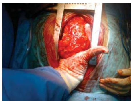
Figure 2. A perioperative view of the mediastinum.