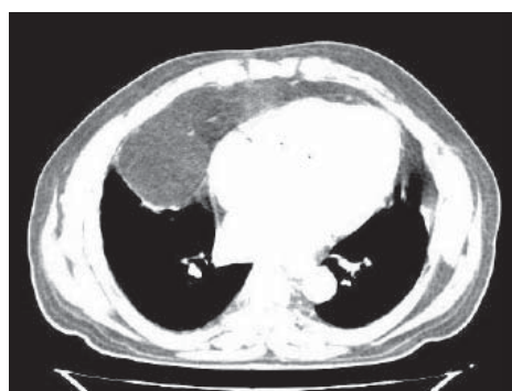
Figure 1. A preoperative thorax CT image.

Hiatal hernia is defined as the displacement of a portion of the stomach through the diaphragmatic esophageal hiatus to the thorax, resulting in various symptoms. A 61-year-old male patient was admitted with chest pain and occasional progressive shortness of breath. Following a chest CT scan and coronary angiography, a decision for surgery was made (Figure 1). After a median sternotomy, a hiatal hernia was seen (Figure 2 and 3). The sternotomy incision was extended by the general surgeon, and the defect was repaired with a 15 x 15 cm dual mesh. After hernia repair, coronary bypass surgery (LIMA-LAD, Ao-D1, Ao-RCA bypasses) was performed with cardiopulmonary bypass. The patient was discharged on the fifth postoperative day without any problems. It is important to consider hiatal hernia among extra-cardiac factors in patients presenting with chest pain.