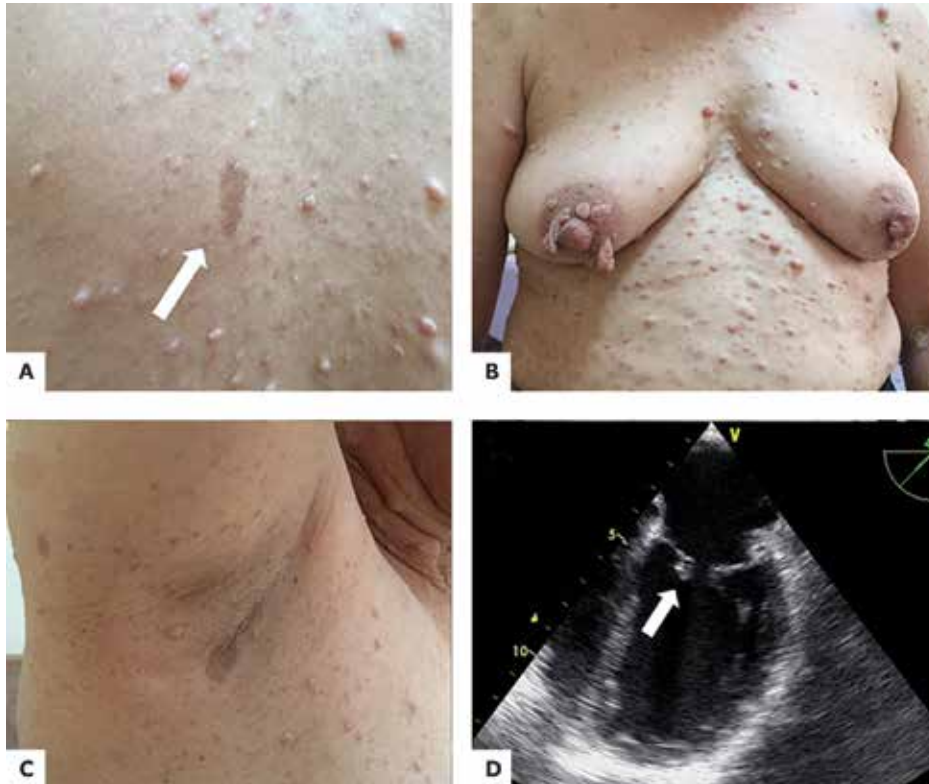
Figure 1. Numerous cafe-au-lait macules (A), cutaneous neurofibromas (B), and axillary freckles (C), transoesophageal echocardiography demonstrated an anterior mitral neurofibroma (D).

A 53-year-old female with neurofibromatosis type 1 (NF-1) was evaluated because of shortness of breath. Her physical examination revealed numerous cafe-au-lait macules (Figure 1A), cutaneous neurofibromas over her whole body (Figure 1B) and axillary freckles (Figure 1C). During her cardiac examination, a grade 3/6 systolic murmur was detected on mitral focus. Echocardiography revealed moderate mitral regurgitation. To conduct a detailed examination, transoesophageal echocardiography was performed. It showed moderate mitral regurgitation (Figure 2) and a 6 × 8 mm anterior mitral valve nodule (Figure 1D). Taking into account the patient's cutaneous neurofibromas, we assumed that the nodule on the mitral valve was a neurofibroma. Further examination with CT or MRI was suggested, but the patient refused it.