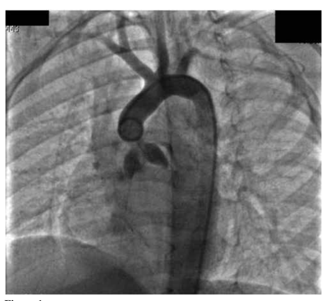
Figure 1. Aortography was performed before the operation, and all demonstrated a typical hour-glass type stenosis of Case 1.