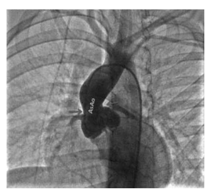
Figure 2. Aortography was performed before the operation, and all demonstrated a typical hour-glass type stenosis of Case 2.

After informed consent, the patient underwent the corrective surgery under general anaesthesia and cardiopulmonary bypass. Standard surgical techniques were used in two patients by the