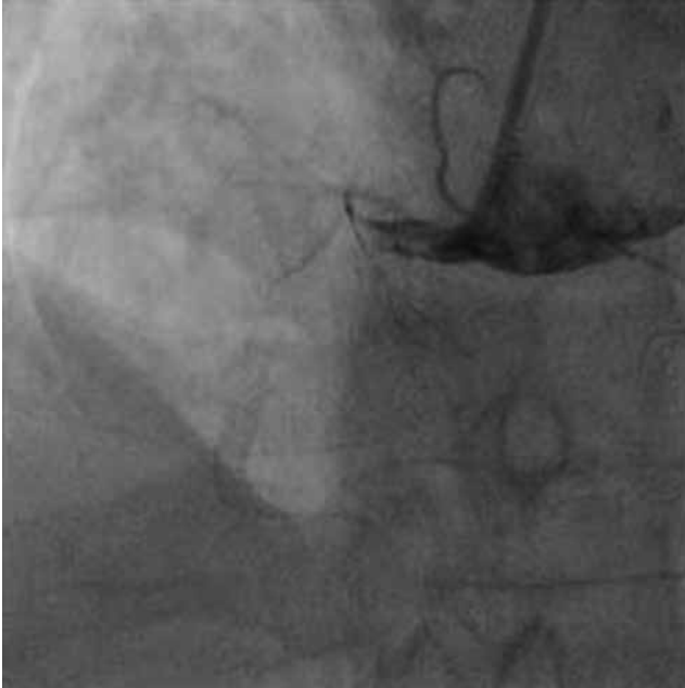
Figure 1. Total occlusion of proximal right coronary artery.

TIMI-1 flow and retrograde dissection involving both proximal RCA and the focal region of the aortic root near the RCA ostium. Immediately, BMS ( 4.0 \times 15 Simchrome stent, Simeks, Turkey) was deployed with a minimal overlap. After successful implantation of the second stent and after dilatation, TIMI-3 flow was settled again (Figure 2). The coronary dissection line disappeared (Figure 3). Focal aortic dissection close to the RCA ostium was not advanced.