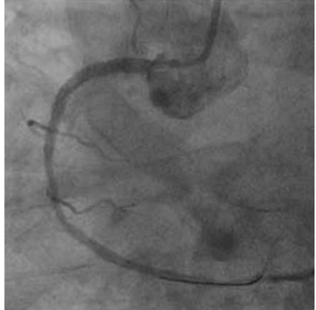
Figure 3. Disappearance of coronary dissection after stent implantation.

iatrogenic aortic dissection due to PCI is reported to be 0.02%, although the frequency of coronary dissection is not well known. Aortocoronary dissection is more common in PCI performed for acute myocardial infarction than in elective PCI (6) . Coronary dissection is associated with some risk factors related to the lesion type and technical procedure. Factors making the artery more prone to dissection are being calcified, egzantric, ostial, long or kinky as well as being morphologically complex in nature. Deep seating the catheter during engagement of the coronary ostium, exceeding the ratio of 1:2 between the balloon and artery or reaching high inflation pressures also facilitates the dissection probability technically (7) . Whenever there is a sudden onset of chest pain, rapid fall in blood pressure or stagnation of contrast material within the aortic root, especially following LAD or RCA ostial lesion interventions, retrograde aortic dissection must be kept in mind. Aortocoronary dissection has been reported to be more visible in RCA lesions in some series (8,9) .