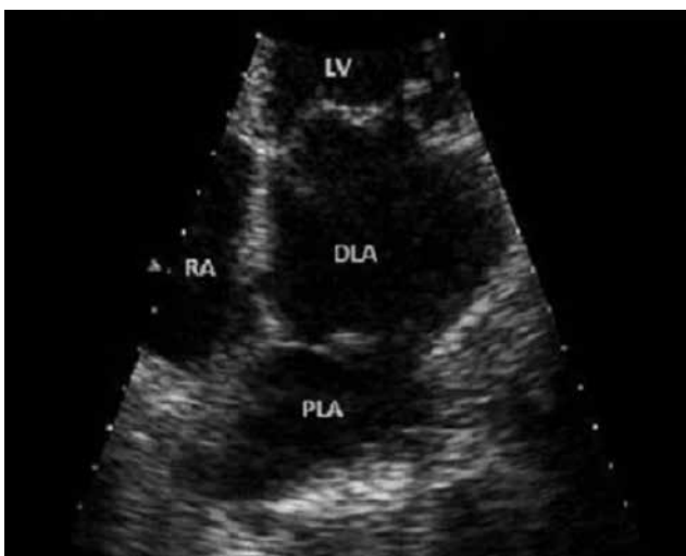
Figure 2. Preoperative echocardiography showing a membrane in the left atrium PLA: Proximal left atrium, DLA: Distal left atrium, RA: Right atrium, LV: Left ventricle.

On cardiac catheterisation and pulmonary angiography, the pressure measurements were as follows: left ventricle 95/6 mmHg, aorta 96/60 mmHg, right ventricle 27/4 mmHg,