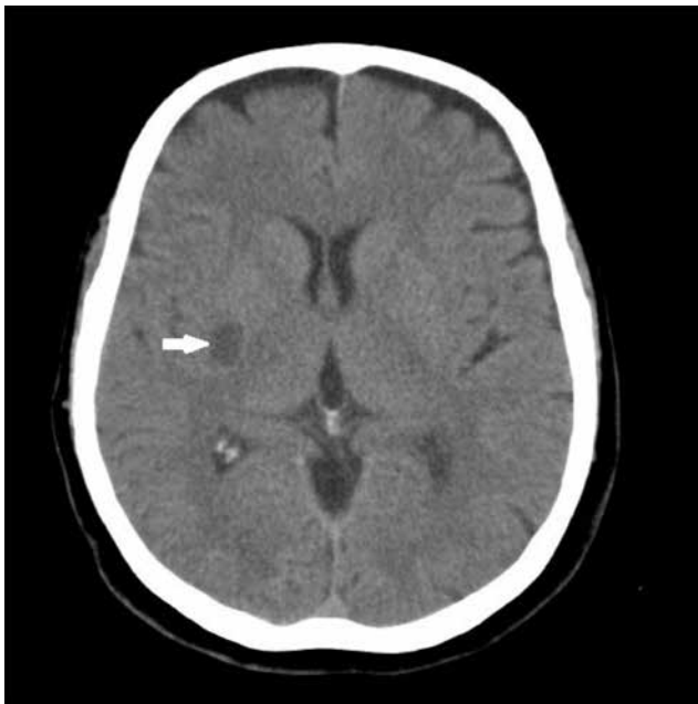
Figure 1. Non-contrast computed tomography imaging of the brain performed 2 days after the onset of left-sided haemiparesis and dysarthria showing a hypodense lesion (arrow) corresponding to acute-subacute ischaemic infarction of the right cerebral hemisphere in the area adjacent to the basal ganglia.

On two-dimensional transthoracic echocardiography, the left ventricular ejection fraction was 66%, diameter of the aortic root was 27 mm, diameter of the left atrium was 48 mm, left ventricular end-diastolic volume was 44 mm, left ventricular end-systolic volume was 28 mm and mitral peak gradient was 4 mmHg. Valvular morphologies were natural, with an abnormality of superposed to left atrium with a pathological colour Doppler flow “cor triatriatum” (Figure 2).