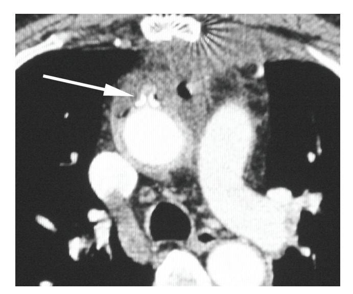
Figure 3. Postoperative control computerized tomography angiography. Arrow shows the suture line.

under 90 mmHg with controlled esmolol infusion. Single 5 or 6 U-sutures used to plicate the fusiform aneurysmatic segment of the aorta between the free sides of graft (Figure 1A,B). Systolic arterial pressure was dropped about 40 mmHg via inferior vena cava occlusion by fingers to tie sutures (Figure 2A,B). After hemodynamic stabilization, operation was terminated. The external tube graft did not retract the proximal anastomosis due to the exclusion of the proximal anastomotic site from the wrapping side. All patients had an uneventful recovery.