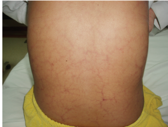
Figure 4. Abnormally dilated blood vessels.