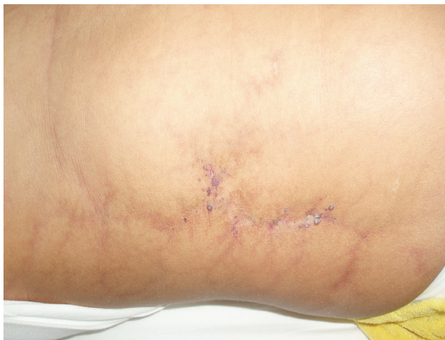
Figure 3. Abdominal skin defect.

Clinically, the patient had cyanosis, clubbing, cardiomegaly, left parasternal heave, and epigastric pulsations. The first heart sound was normal, whereas the second heart sound was wide and fixed split with accentuation of the pulmonary component. Tricuspid murmurs and pulmonary regurgitation were also present. The chest examination was clear.