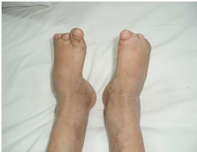
Figure 2. Asymmetric transverse limb reduction defect.