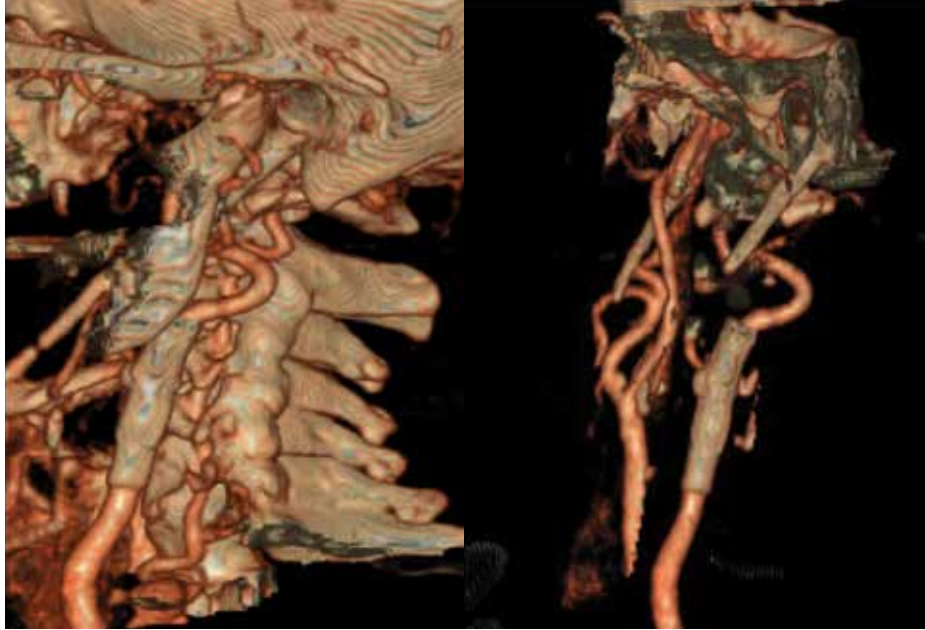
Figure 2. After 6 months, stent patency was still present according to the control CT angiogram.