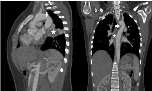
Figure 2. Computed tomography image revealed a pseudocoarctation with limited poststenotic dilatation of the descending thoracic aorta and the descending aorta pushed through the right hemithorax without intravascular extension.