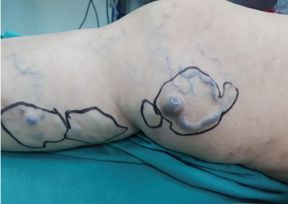
Figure 1. A 56-year-old female patient presented with venous insufficiency in the right leg. Doppler examination revealed grade 4 saphenofemoral junctional insufficiency along with a knee segment dilatation of 6 mm. Moreover, cystic dilatation was noticed in the venous branch segment at the distal medial thigh just over the right ankle.

Endovascular radiofrequency ablation of the great saphenous vein is an alternative treatment option for the surgical stripping of varicose veins. The surgeons can safely and effectively perform this procedure. The ablation is done by inserting a catheter base from the distal part of the great saphenous vein. The skin is punctured at the most preferable site using a needle. However, some situations require alternative regions for the insertion of the catheter and its withdrawal. The following images show such alternative solutions.