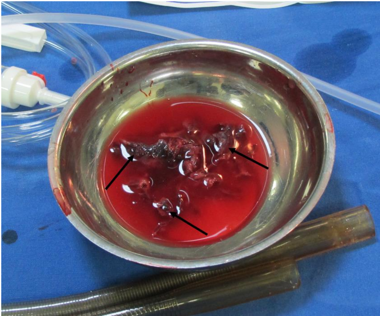
Figure-3: Arrows show thrombogenic materials which were extracted from pulmonary arteries.