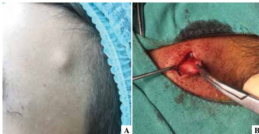
Figure 2. A) Preoperative view of the pulsatile mass in the left temporal region, (B) Intraoperative view of superficial temporal artery pseudoaneurysm prior to resection.

Superficial temporal artery pseudoaneurysm was first described by Bartholin in 1740. It usually occurs a few weeks or months after blunt trauma. The superficial temporal artery is the terminal branch of the external carotid artery and is divided into two branches, frontal and parietal. Although facial, internal maxillary, and internal carotid artery pseudoaneurysms have been reported, superficial temporal artery is affected the most because it has a superficial course directly under the skin and is vulnerable to trauma. Differential diagnosis includes lipoma, hematoma, enlarged lymph node, neuroma, abscess, soft tissue tumor, epidermal inclusion cyst, arteriovenous fistula, intracranial lesions, subdural hematoma, middle meningeal artery aneurysm with temporal bone erosion, and angiofibroma (5) .