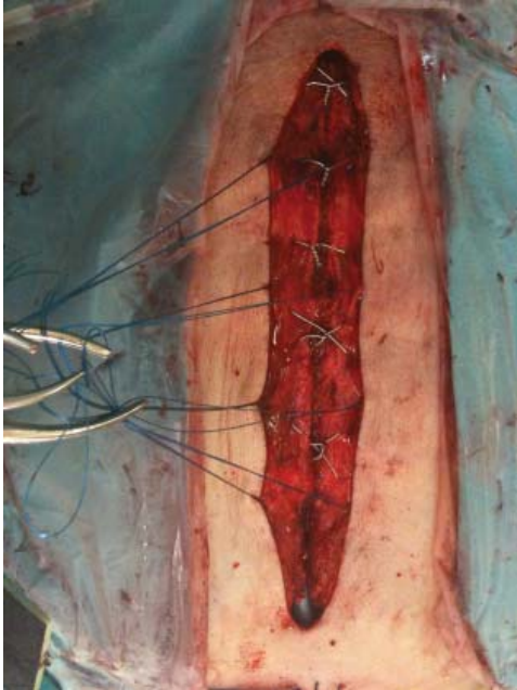
Figure 1. Before the sternal wires tied, polyglyconate (Maxon) sutures were additionally placed intercostal spaces.